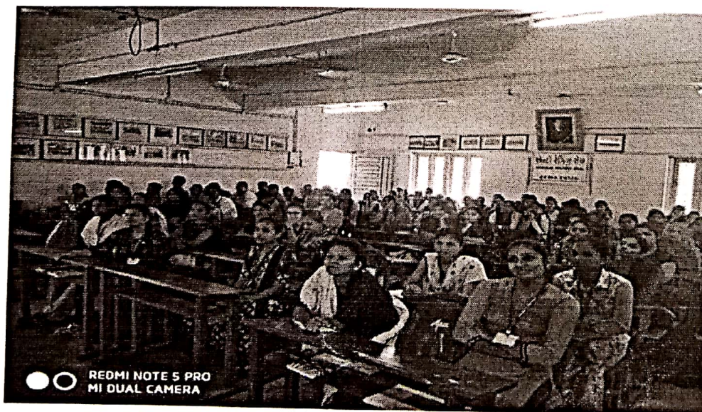
F.Y and S.Y Students